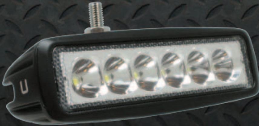
685W 18-WATT LED BAR (6 x 3-WATT LEDs)